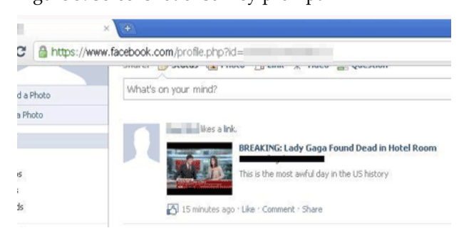
Figure 4: "Like" wallpost of affected user

According to Paul Pajares, a Fraud Analyst [7], click-jacking attack is performed because Facebook does not display any warning site when the site is redirected and the site's SSL/HTTPS feature is bypassed. Hence, attackers take this vulnerability to perform their attack.