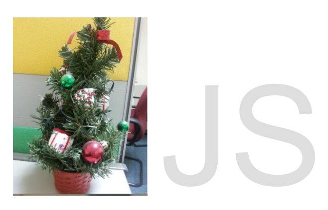
Figure 6: A photo that doesn't shows location trait

The security issues arise when most of the users are not aware that the Geotagging technology is also including in the mobile devices that have GPS functionalities. When a user take a photo using their smart phone, the exact location of the picture is actually also recorded in the EXIF data of the JPG photo, if the GPS function is on. Moreover, some of the mobile devices have the Geotagging function activated on default, and hence recorded the picture's location automatically without the user's conscious. For example, iPhone have the Geotagging function activated by default while Android phone have the function off by default.